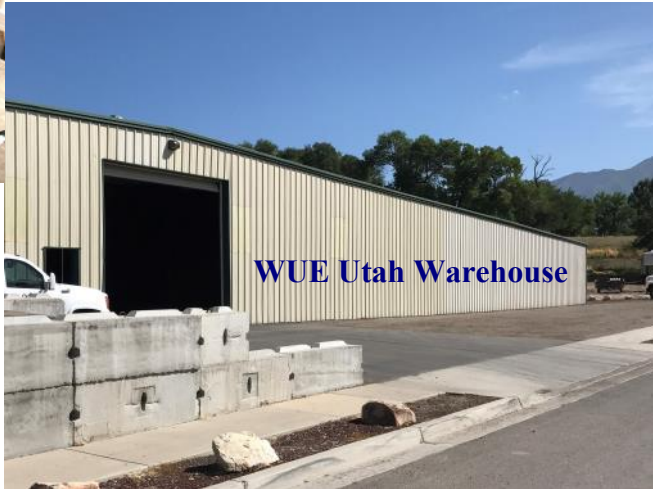
WUE Utah Warehouse