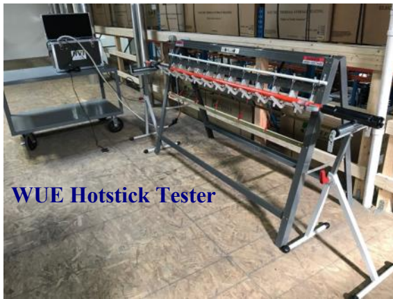
WUE Hotstick Tester

The WUE test lab has again expanded their testing services and now offers testing of fiberglass hotstick tools. Additionally the test lab now offers the assembly of both grounds and jumpers that are built to your specs. WUE is stocking many of the common clamps and ferrules in order to provide the grounding and jumper kits within a short lead time. Please see your WUE account manager for stick testing pricing or call your WUE inside sales specialist to order replacement grounds or jumpers built to your specifications. Per OSHA 1910.269 Part J, fiberglass hotstick tools should be tested every two years and whenever required.